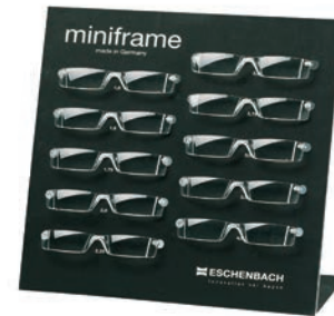
2910-01 MiniFrame Display