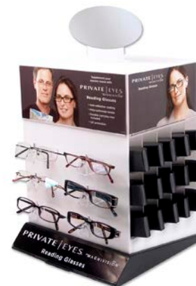
FGX-PE2372 Private Eyes Display