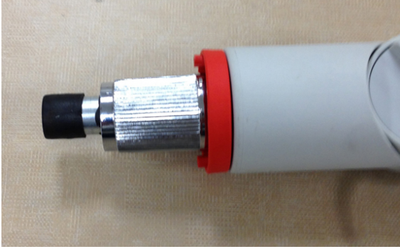
Complete Lamp Magnifier with all pieces attached