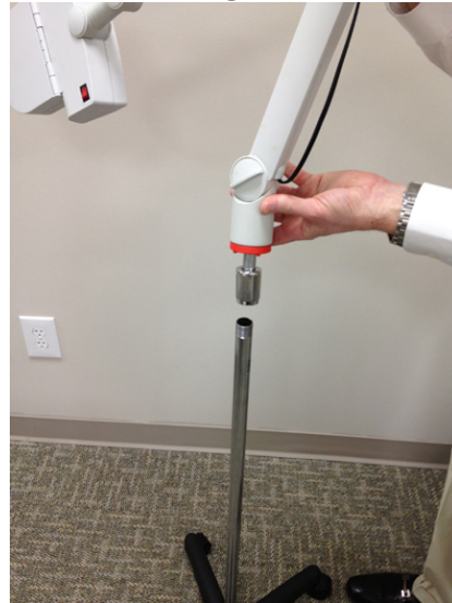
Place the Lamp Magnifier on top of metal pole that is from the base and tighten