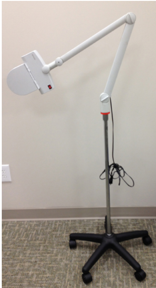
Complete Lamp Magnifier on moveable stand